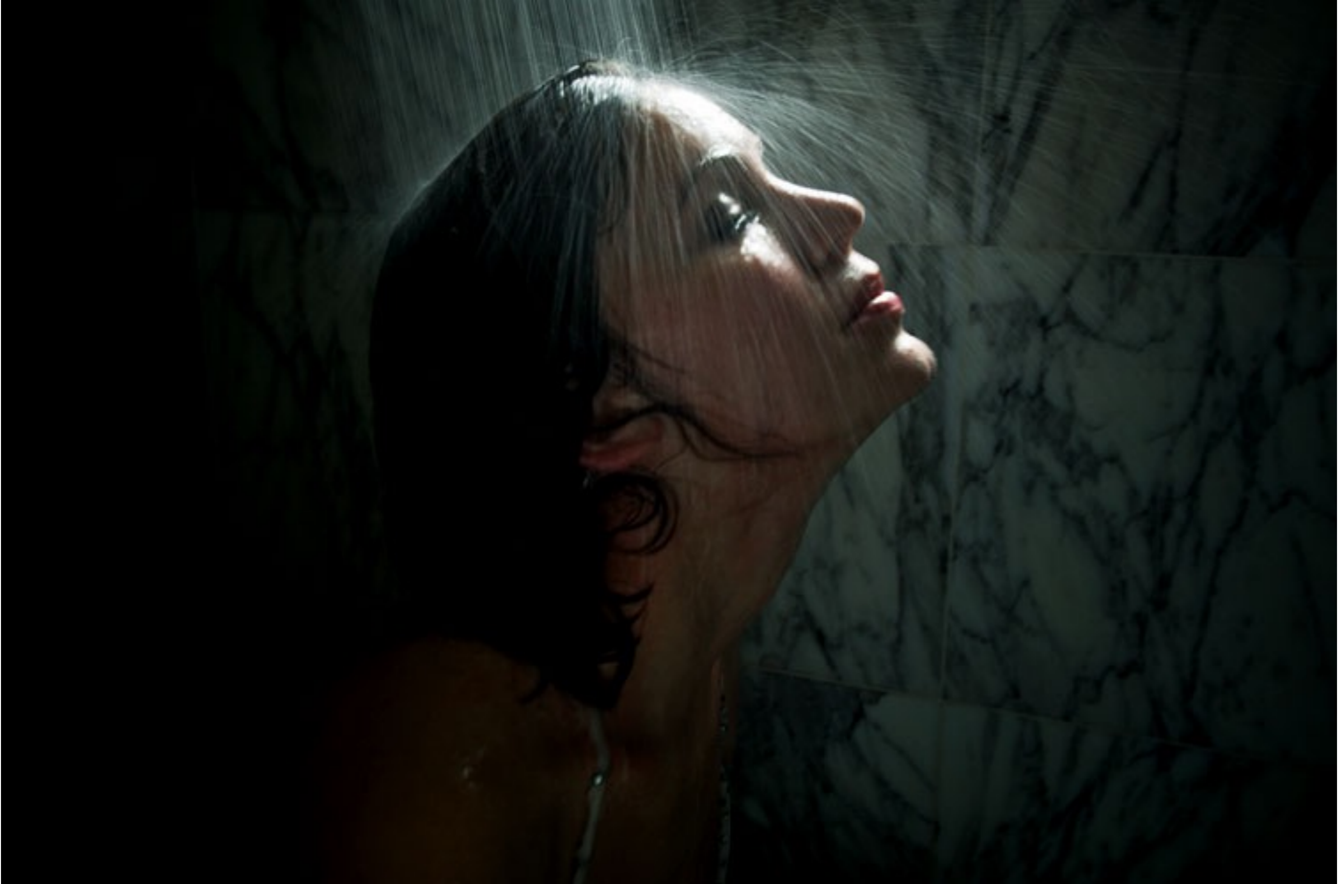
□ Manjari Sharma , Katelyn , The Shower Series , 2009, archival inkjet, 20 x 30 inches, 50.8 x 76.2 cm: image, 21.5 x 31 inches, 54.6 x 78.7 cm: frame, edition 1/6, $1,750 (framed)