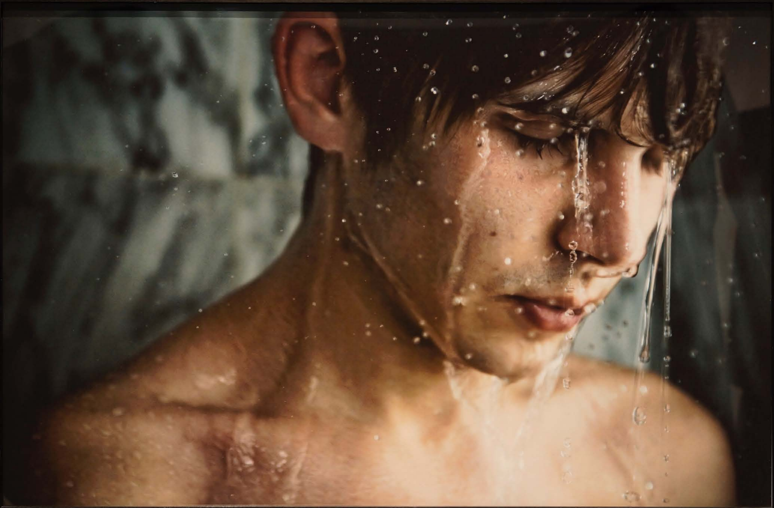
□ Manjari Sharma , Alex , The Shower Series , 2009, archival inkjet, 20 x 30 inches: image, 50.8 x 76.2 cm, 21.25 x 31.5 inches: frame, 54 x 80 cm, edition 3/6, $2,400 (framed)